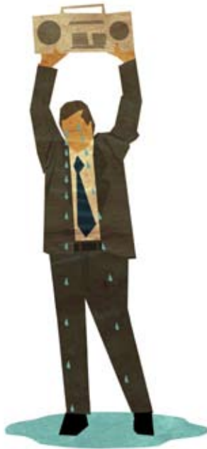
Illustration by Ryan Graber

or benevolent gestures expressing sympathy or a general sense of benevolence relating to the pain, suffering, or death of a person involved in an accident, and made to that person or to the family of that person, shall be inadmissible as evidence in a civil action." But the statute also says that "[a] statement of fault, however, which is part of, or in addition to, any of the above shall not be made inadmissible." This is problematic, since studies suggest that partial apologies (those that do not include any statement of fault) do not deter litigation in the same way. In fact, under